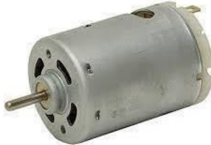
FIG: 5.1 DC MOTOR